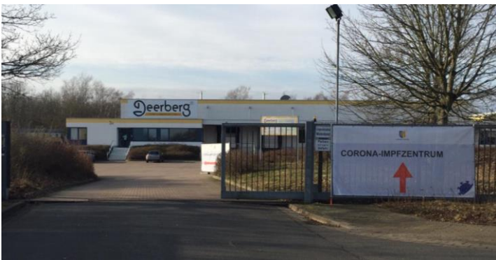
Entrance to the Lüneburg COVID-19 Vaccination Centre